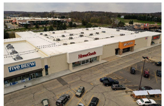
Empty storefronts reactivated at the former Shopko site in West Bend

In December 2021, CORTA West Bend, LLC, purchased the vacant 94,000-square-foot site located at 1710 S. Main Street with plans to redevelop the property. In partnership with the City of West Bend, the developer utilized $300,000 in funding provided by Washington County's Revolving Loan Fund to assist in remediation of the site, which is now home to four national retail tenants. Filling the once vacant site are TJX Companies HomeGoods and Sierra, as well as Five Below and Big Lots.