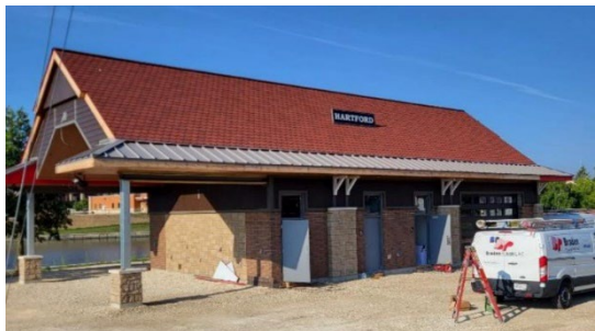
Construction is underway on Hartford's new Centennial Park Pavilion