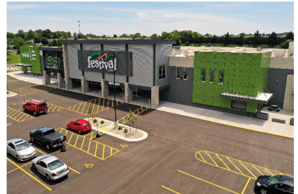
Newly redeveloped anchor tenant space for Festival Foods

The August 2023 opening of Wisconsin's 40 th Festival Foods in the former brownfield site once occupied by a 69,000-square-foot Kmart exemplifies how the Washington County Site Redevelopment Program (SRP) has utilized scarce grant dollars to encourage projects that bring vacant sites back into economically productive use. Utilizing $18,500 in grant funding from the 2017 US EPA Assessment Fund, the City of Hartford worked with Vandewalle & Associates to create inspiring marketing materials and a reuse plan for the site. This effort generated developer interest in the revitalization of the vacant property. Anchored by Festival Foods, which brought over 200 jobs to the City, the redevelopment and reuse of this site encouraged further private reinvestment, resulting in several other retailers locating operations onsite. The addition of Bubon Orthodontics, Cost Cutters, Caribou Coffee, Planet Fitness, and Goodwill to tenant spaces is now creating economic activity, strengthening the City's commercial tax base, and breathing new life into a once-vacant site.